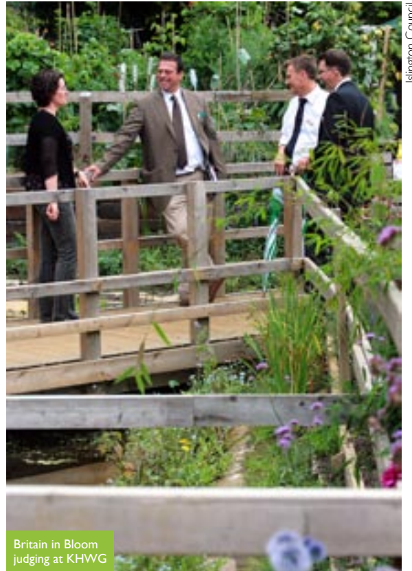
Britain in Bloom judging at KHWG