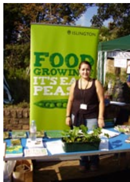
Getting the measure of some prize-winning runner beans, left, and information at the ready, above, at the Horticultural Show last month